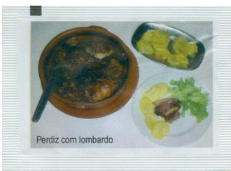
Perdiz com lombardo