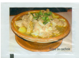
Sopa de cachola