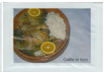
Coelho no barro