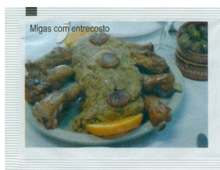
Migas com entrecosto