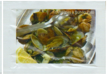
Amêijoas à Bulhão Pato