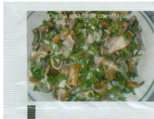
Oreina assada de coentradar