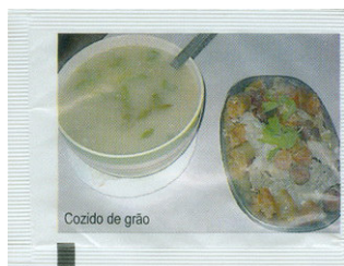
Cozido de grão