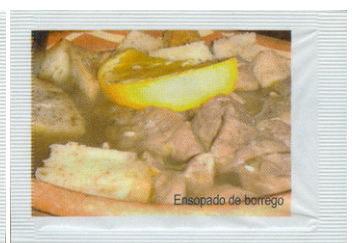
Enfopado de borrego